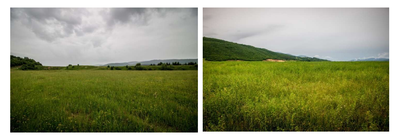
Figure 2. Left: View of the Gračanica 1 landfill; Right: View of the Gračanica 2 landfill